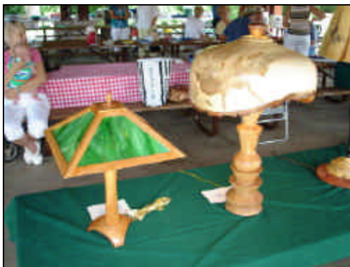
Advanced Class Lamp Entries