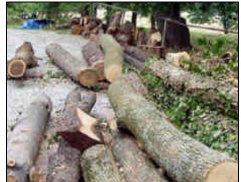
From Logs to bowls, platters or whatever you can imagine

The free wood was a big hit with the approximately 50 turners who attended the event. Watching the turners scavenging for wood was like watching a colony of ants attacking a dead tree. It kept three chain saws busy, most of the morning, to keep up with the requests for logs.