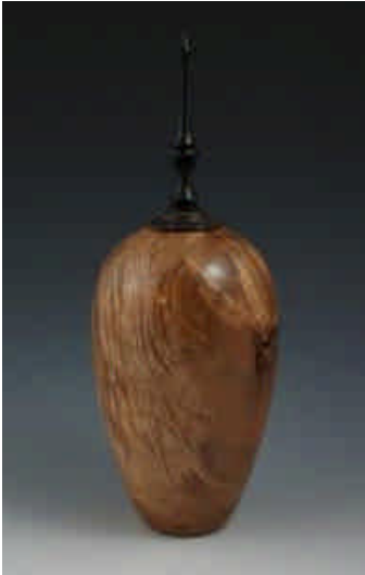
Maple vase with ebony finial by Jamie Donaldson