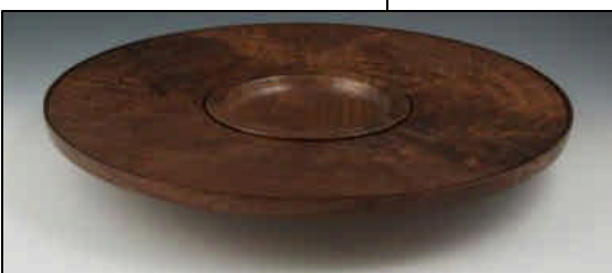
Textured Walnut Platter by John Lannom

After frying the sausage, combine it with all the other ingredients in the large pot and bake uncovered at 350 degrees for 1 1/2 to 2 hours.