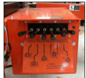
For the lazy woodcutter...

The event was a big hit and everyone left with new supply of turning wood.