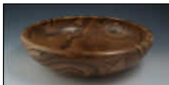
English Walnut Bowl by Lowell Converse