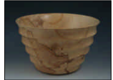
Elm Bowl by Bob Cochoy

Ingredients: 1 cup chopped celery 1 cup chopped onion 1 can kidney beans 1 can lima beans 1 can yellow beans (wax) 1 can green beans 1 can pork and beans (do not drain) 1 can tomato soup (something like Campbell's 10-10 1/2 ounce) 1 can tomato paste (6 oz.) 1 cup brown sugar 2 tablespoons prepared mustard 1/2 teaspoon chili powder 1 pound sausage (Jimmy Dean, Webbers, etc.) 1/2 pound hot sausage