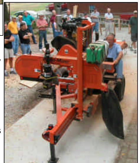
The Wood-Mizer in action