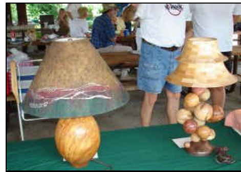
Advanced Class Lamp Entries