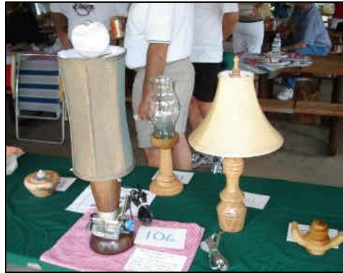
Novice Class Lamp Entries