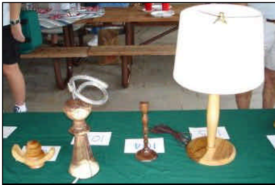
Novice Class Lamp Entries