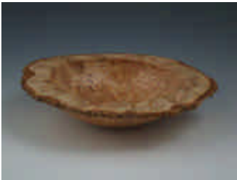
Black ash burl bowl by Keith Bundy