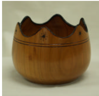
Pyro pot by Bruce Gibson

17th Club Meeting Jimmy Clewes Demo Northminster Church Compton Road