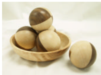
Juggling Balls by Arnold Ward