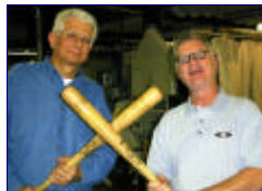
Wonder if we can start a fire by rubbing these together . . . ?

It was a fun and worthwhile day spent with friends.