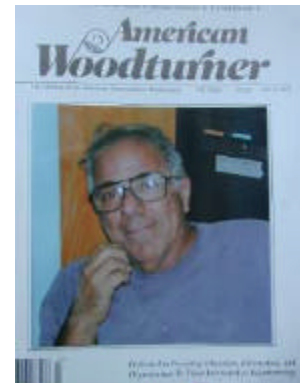
Does anyone recognize this cover boy?

“Work produced in STUDIO sells for more than work produced in SHOP”