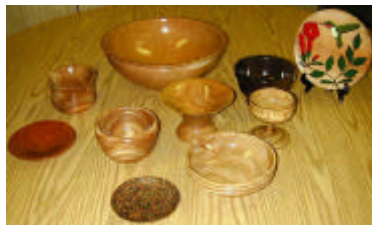
More Show & Tell items from the February meeting.