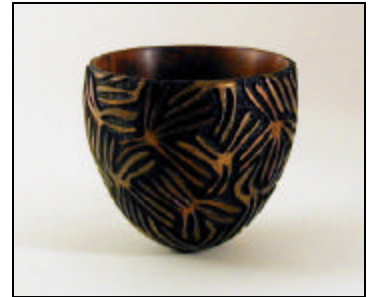
Coral Inspiration #1. First in a series of turned and textured objects by Andi Wolfe. Used with permission.

We will meet again at the Northminster Presbyterian Church at 703 Compton Road. Take the Galbraith Road exit off I-75, west to Vine Street (Rt 4), north to Compton Road and then west on Compton to the church. Use the form below and save $5 off of the meeting cost by sending in your money early. Meeting cost is $10 in advance and $15 at the door. Once again, lunch will be provided. Should be a great day!