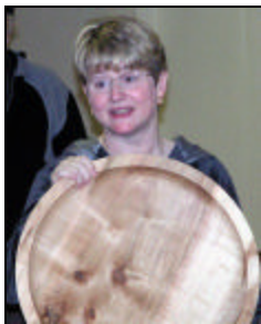
Try carrying this platter when it's full of food!