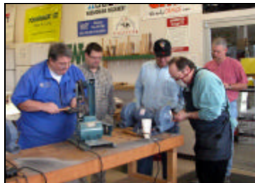
Hands-on sharpening class.