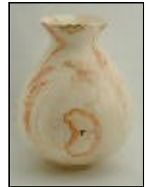
Bleached Box Elder by Barb Crockett