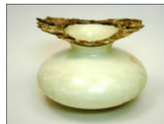
Bleached Natural Edge Box Elder Vessel by Barb Crockett

All new members of OVWG should enter at their appropriate skill level.