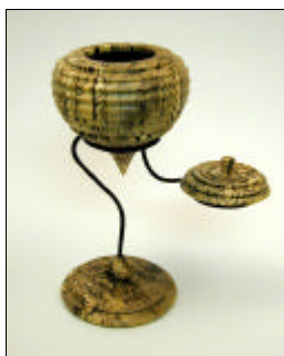
Spalted Maple lidded box with stand by Dickinson Gray.

This should be an easy one for all of the club members to get in on.