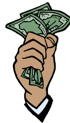
Turn your extra "stuff" into CASH!