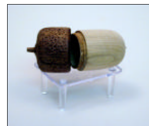
Threaded Acorn Box with textured lid by Bill Sullivan

waiver applies only to OVWG members that enter the contest, otherwise, it's $10 each to join the club and vote for a winner and eat a great lunch. You have seen the entries before when the rules have been spelled out, this should produce some interesting looking stuff when it's almost all left up to the imagination of each turner.