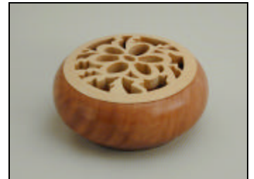
Lidded pot turned by Larry Lockwood.