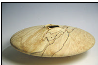
Turnings by Alan Lacer.